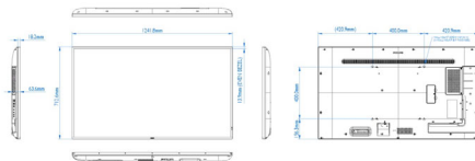
Philips 55BDL3510Q Version 3.0 Release Date: 20200314