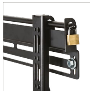
Security locking screws, Allen key and locking bars provided for a secure installation