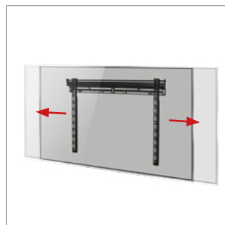
Post installation screen alignment for perfect positioning every time