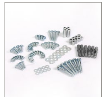
All mounting hardware included