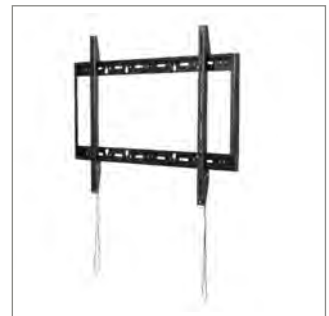
All mounting hardware included