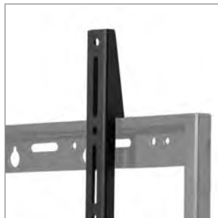
Simple 'Hook-on' installation