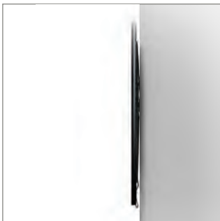
Low profile design mounts the screen 30mm from the wall