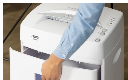
Removable 42-litre collection bin for easy disposal.