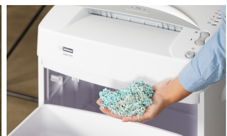
2x10 mm particles with security level P-5 according to DIN 66399 (ISO/IEC 21964).