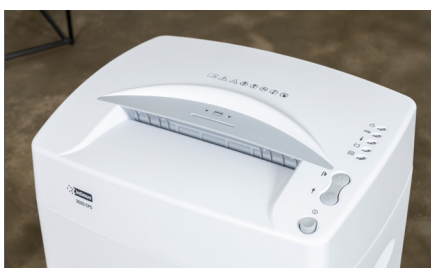
Intuitive operation thanks to clear push buttons and LED display.