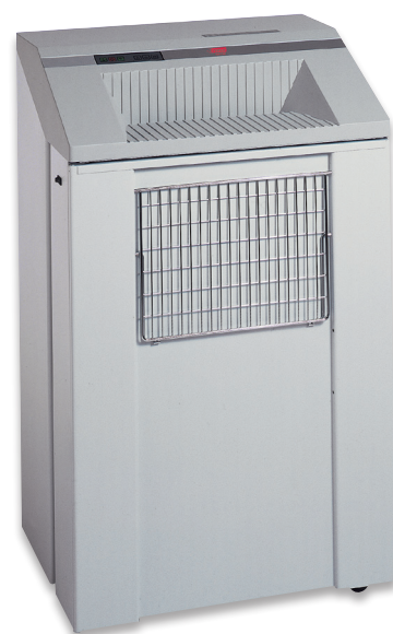
W/D/H 70 x 55 x 112 cm