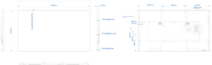
Philips 86BDL6051C Version 2.0 Release Date