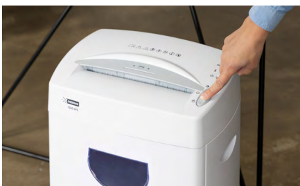
Automatic start/stop function and anti-paper jam technology.