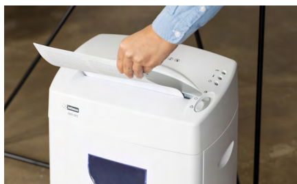
Shreds documents with paper clips and staples.