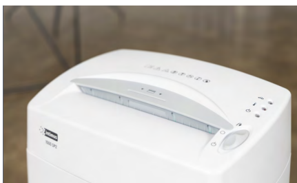
Intuitive operation thanks to clear push buttons and LED indications.