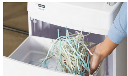
4 mm stripes with security level P-2 according to DIN 66399 (ISO/IEC 21964).