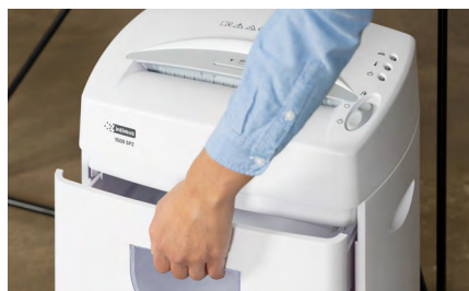
Removable 22-litre collection bin for easy disposal.