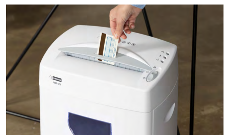
Credit cards can also be shredded via a separate feeding slot.